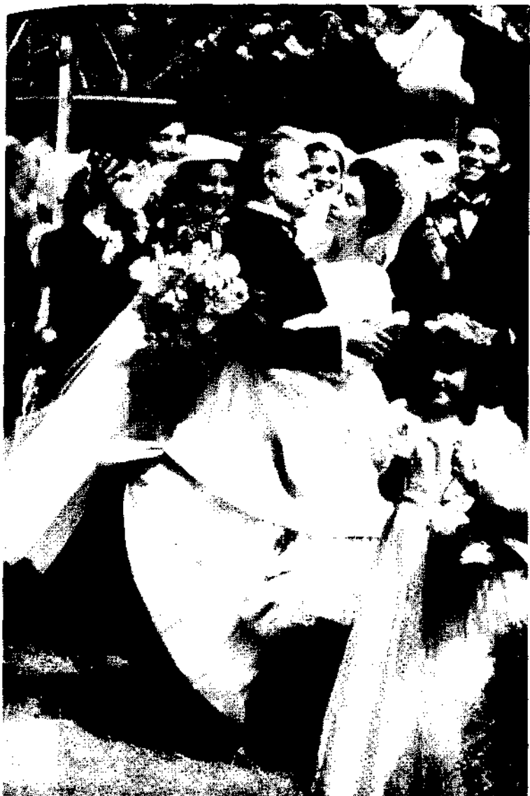
Don Corleone took his daughter by the hand and danced with her to the slow, Sicilian music.